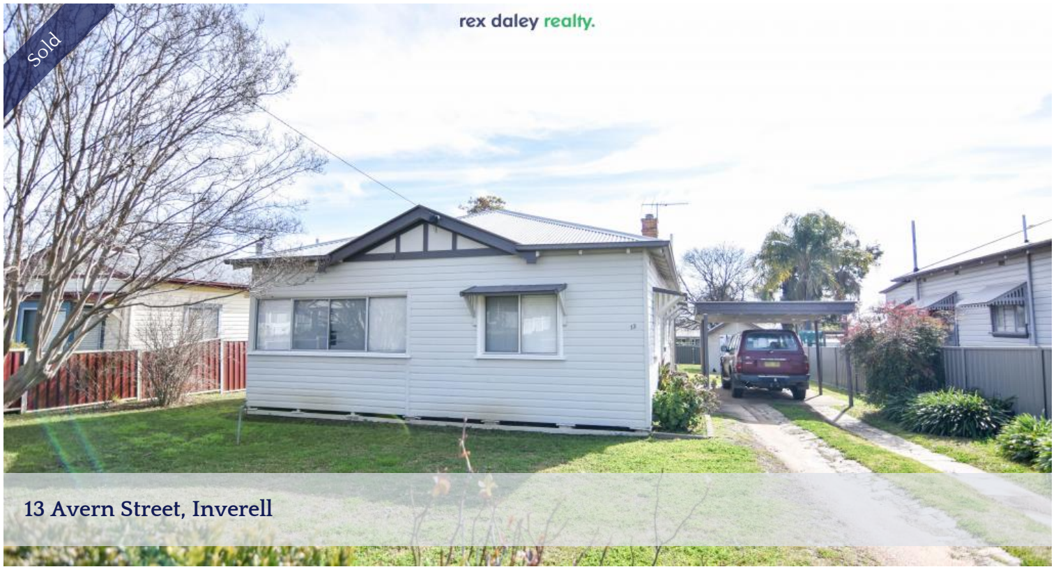
13 Avern Street, Inverell