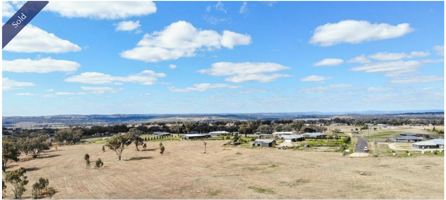
Lot 41 Daley Close, Inverell